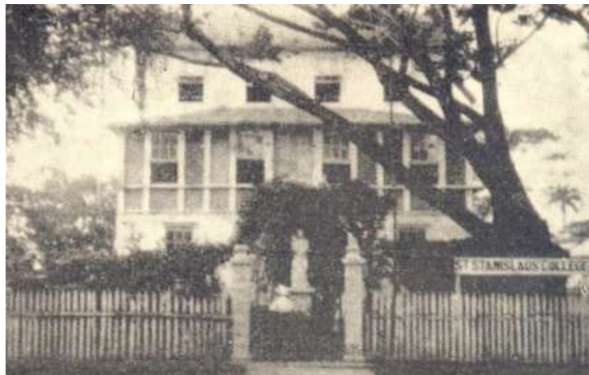
The Old Grammer School – St Stanislaus College 1943 Magazine Photo