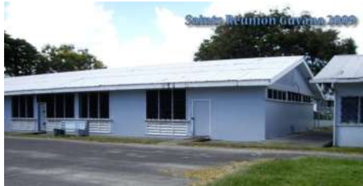
Saints Workshop – Reunion 2009 Photo