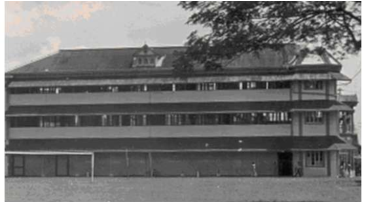
1968 Photo of Weld Wing

It was a very handsome building with open galleries. However, it was discovered that driving rain flooded the corridors, so blinkers were added to protect them.