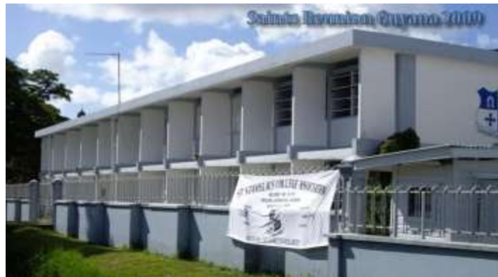
Hopkinson Wing – Reunion 2009 Photo